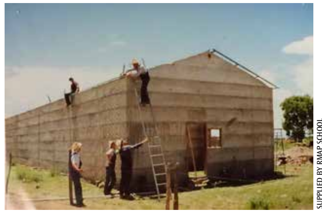
Building a barn

Like their Ackermaun (farmer) ancestors, today's LGM families highly value an agrarian lifestyle. Subsistence agriculture is considered unifying, a way to work as a family unit. Drawn to the farmlands of Alberta, most LGM men find work in the agricultural sector where they can work with their hands. Many work as farm labourers on potato, onion, sugar beet and dairy farms, at feedlots, and at seeding and livestock operations. Most of these jobs are seasonal, resulting in unemployment for parts of the year. Though some in mainstream society perceive those who work the land as unmotivated and unskilled labourers, for the LGMs, blue-collar work enables them to carry past traditions into the present day.