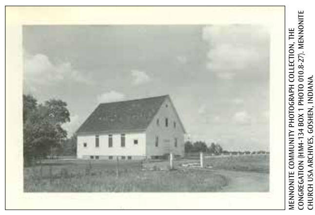
Salem Mennonite Church in Tofield, Alberta, on August 9, 1948.

Religion is a way of life for LGMs. Life is centred on Christ, the Bible and simple living. Being obedient to community practices and beliefs is one way in which faith is expressed. A strong belief in living a life separate from the world is adhered to, although in recent decades in Alberta, some LGM community members have felt it necessary to interact with mainstream society.