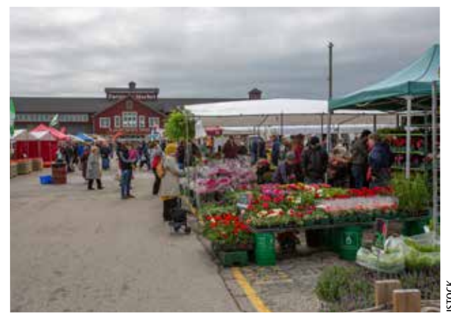
Farmers' Market with local Mennonite farming communities

Low German is mainly a spoken language, so alternative spellings exist. It is common for parents to have limited or no English skills. They may also have limited language skills in German because they are taught only to read the Bible in German.