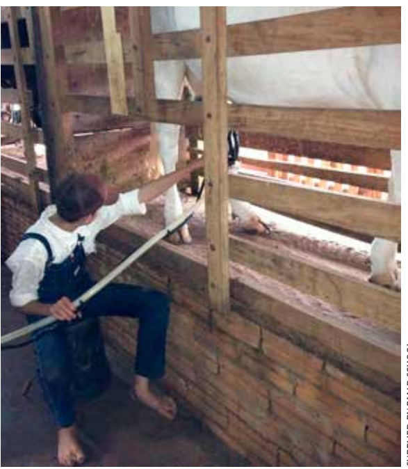
Milking a cow

Other LGM secure construction or manufacturing jobs (road building, welding, fabrication and so forth) and in some parts of the province, more LGM work in these sectors than in the agricultural sector. Like farm labour jobs, these positions are usually seasonal, and LGM families often return to Mexico or other Latin American countries in the off-season.