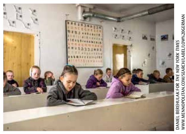
Children attended a Mennonite school in Capulín, Mexico.

Members of some Mennonite groups, including the Old Colony Mennonites, refused the changes instituted by the Manitoba government and shunned members who sent their children to public schools. Feeling displaced once again, the Old Colony Mennonites felt pressure to relocate in order to preserve their unique culture and religious beliefs. Some travelled to Saskatchewan and others went farther afield, to Mexico and Central and South America.