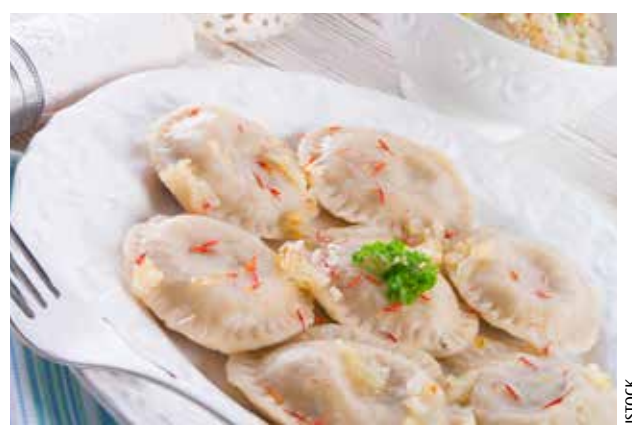
Veraniki (cottage cheese perogies)

Families attend church services and gather with extended family to observe these important religious days. Christmas, Easter and Pentecost celebrations often continue over three days and are referred to as the first, second and third day of the holiday. Most students will not attend school on these days. (Note: the first spelling of each Holy Day is Low German and the second is High German.)