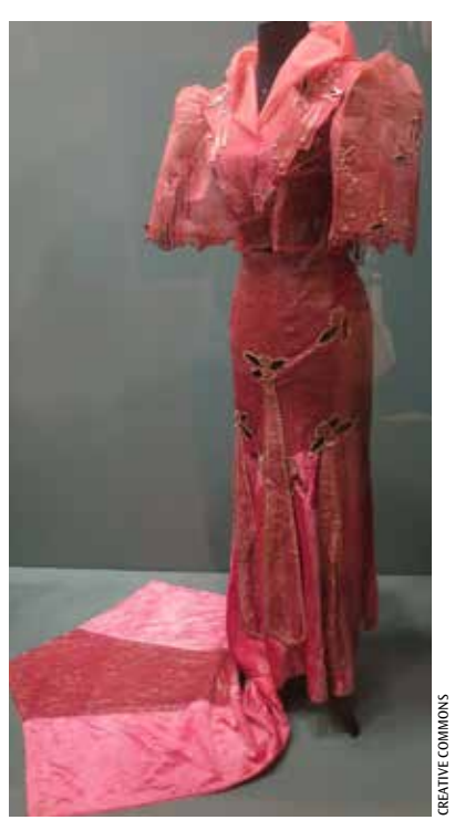
An example of butterfly-sleeved terno

Formal traditional garments worn by women include the butterfly-sleeved terno (tee-AIR-no) and a matching long skirt, an outfit called baro at saya, or baro't saya, baro meaning blouse and saya meaning skirt. The baro't saya is considered the "national costume" of the Philippines. The mestiza dress is a more formal version of the baro't saya, usually made of more expensive fabrics, adorned with more embroidery and lace, and worn at ceremonial events. The kimona is a loose blouse with bell-shaped sleeves worn together with a patadyong or wrap skirt. The kimona dress, as it is sometimes called, is a variation of the baro't saya worn in the Visayan region of the Philippines.