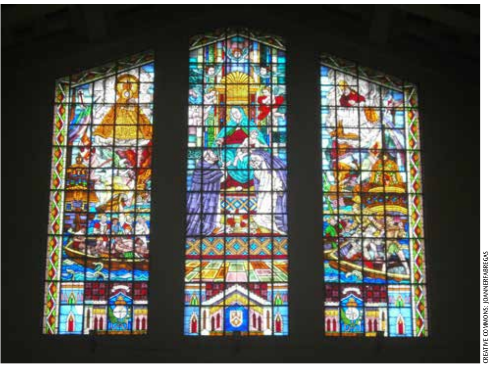
Santo Domingo Church, Manila, Philippines